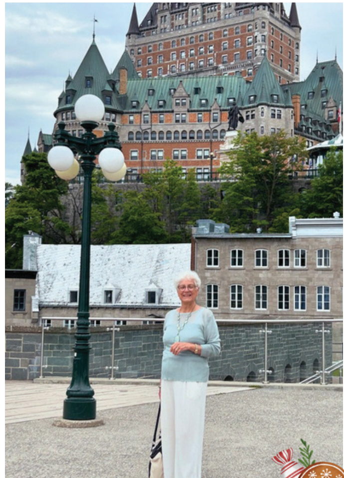
Chateau Frontenac held a special place in Oma’s heart. We’re grateful she was able to see it one last time.

“The staff didn’t just care for my grandparents. They cared for us as a family. They provided comfort when we were overwhelmed, reassurance when we were lost, and gave us the space we needed to simply be together.